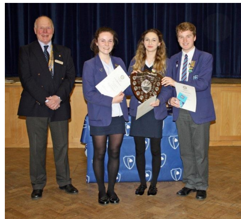
Senior Winners: Twynham School