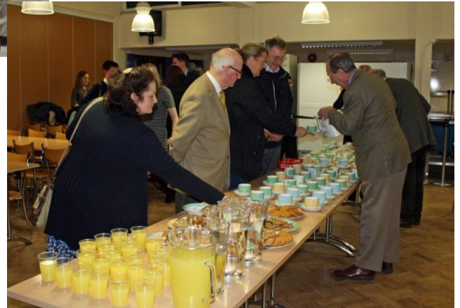
Some of the activities behind the scene ~ The judges of the Intermediate Competition in deliberation and the Catering Team at work in the interval.