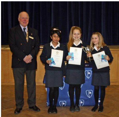
Intermediate Winners: Avonbourne College C Team